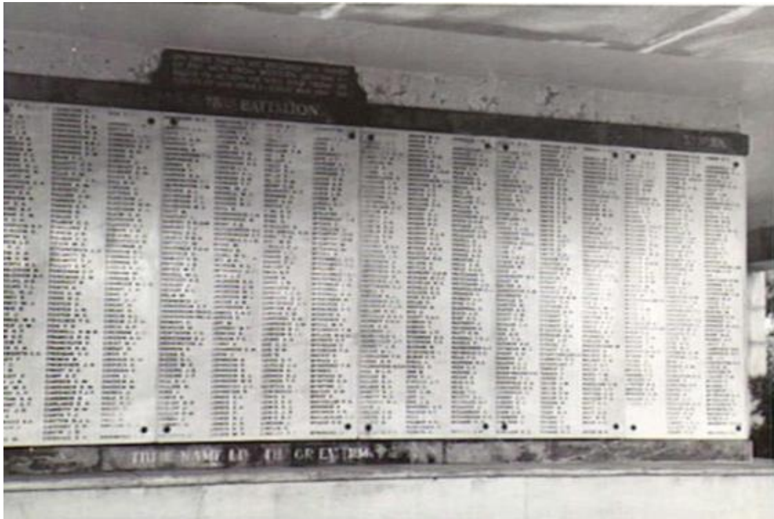
The Roll of Honour of 28th Battalion, A.I.F. at the State War Memorial, King's Park, Perth, Western Australia